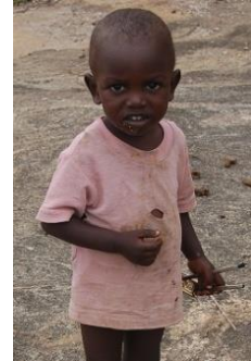
(a hungry child found on a street)

The King and his 63 chiefs who make up his cabinet had a huge task in their hands and they knew it would require reaching out to all for assistance. Because of the children in my kingdom, my life and that of my volunteers has forever changed. We came back to the US, reached out to whoever would listen to our stories and began working to help satisfy the needs in Africa. In October 2009, we hosted the King and some of his 63 cabinet members to a gala in Tennessee: