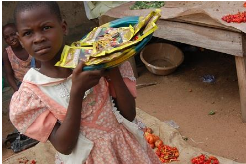
(a child street hawking to raise money for food)